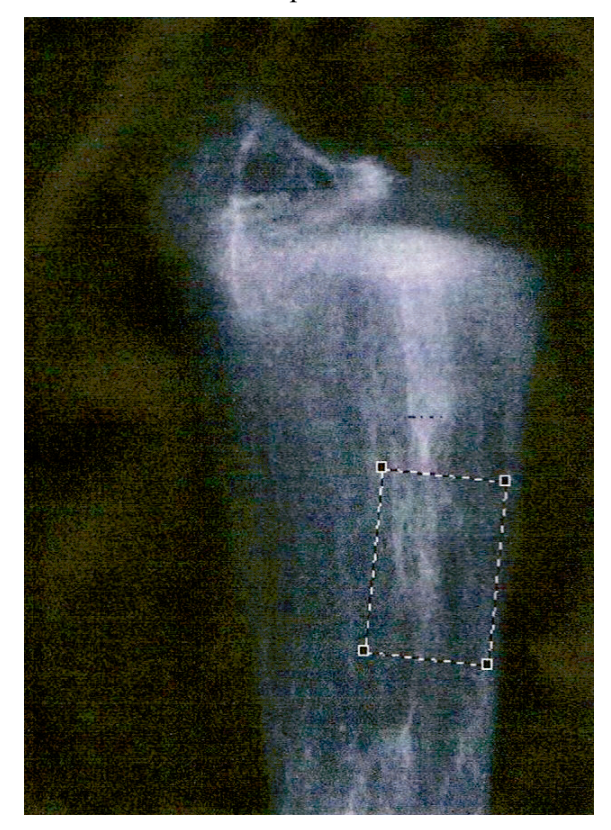
Fig. 1. A fragment of a radiogram of the tibiotarsal bone of a domestic goose with the marked area for analysis (80 x 90 mm<sup>2</sup>).

In order to establish which of the parameters are optimal while analysing the structure of the tibiotarsal bones, the number of trabeculae in given horizontal lines on the marked surface of the radiogram was determined by eye. Then the number was compared with the results achieved using the Trabecula® programme which depended on the selection of individual parameters.