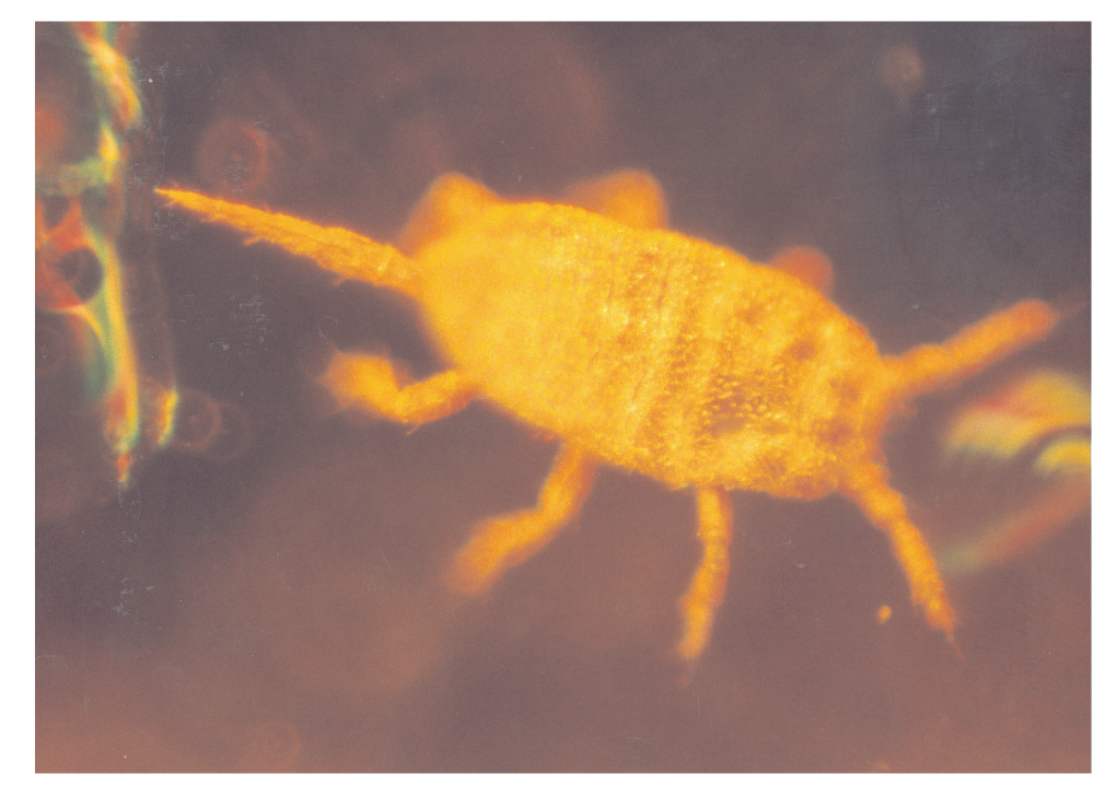
Fig. 4. Acanthochermes longirostris sp. n., holotype (inv. No. 17410 ME ), dorsal view.

Fig. 3. Adelges balticus sp. n., holotype (inv. No. 14699 ME), dorsal view.