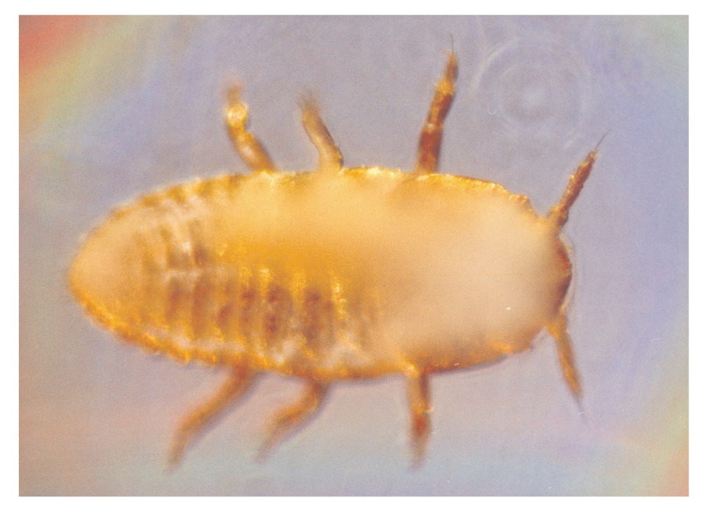
Fig. 3. Adelges balticus sp. n., holotype (inv. No. 14699 ME), dorsal view.